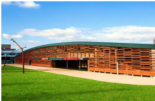
100 meters from the Faculty - 6 rue Augustin Fresnel